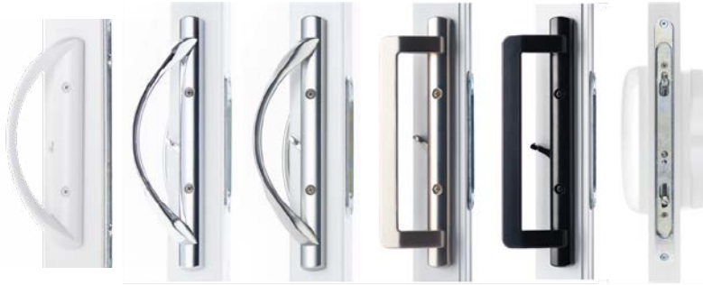
White/ Black (Standard)