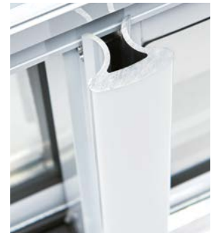
Heavy Duty Interlock