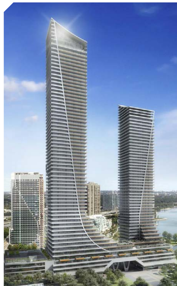
EDS- Eau Du Soleil- Architect: Zeidler Partnership/Richmond Architects. sliding patio doors provided by Clearview Industries