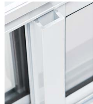
Heavy Duty Reinforcement (J)

Upgrade structural performance from LC-PG25 up to CW-PG55 with added reinforcement