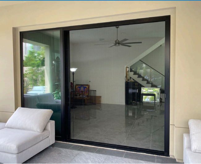
7000-3T with optional retractable screen